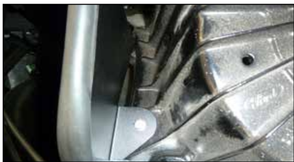
10. Secure the rear mount of the heat shield near the strut tower with the hardware provided.