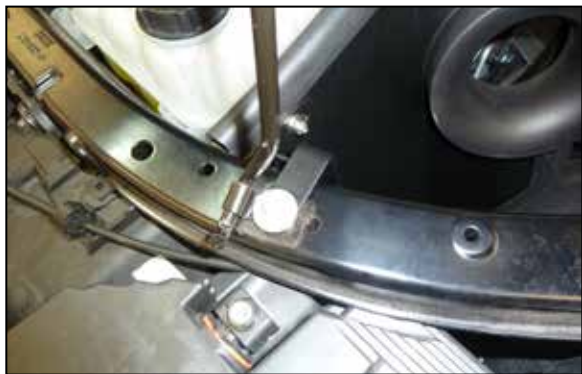
12. Remove the hood prop bolt, align the upper heat shield mounting bracket and reinstall the hood prop bolt.