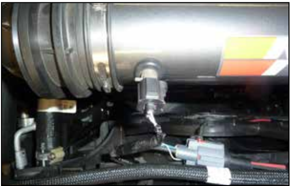
17. Reconnect the inlet temperature sensor electrical connection.