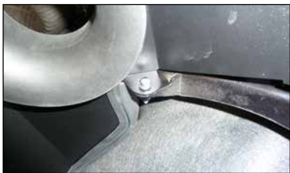
11. Secure the lower front heat shield tab with the hardware provided.