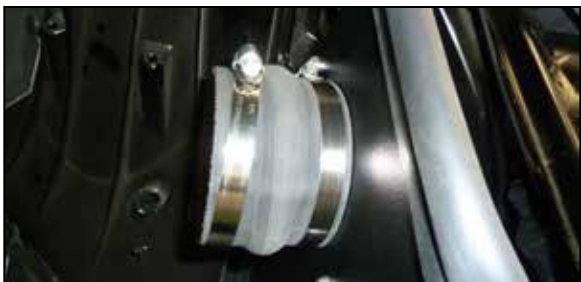
13. Install the hump coupler onto the filter adapter and secure with the provided hose clamp.