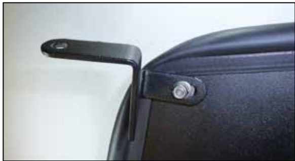
8. Install the provided bracket onto the heatshield as shown using the provided hardware.