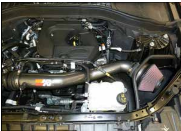
19. Reconnect the vehicle's negative battery cable. Double check to make sure everything is tight and properly positioned before starting the vehicle.