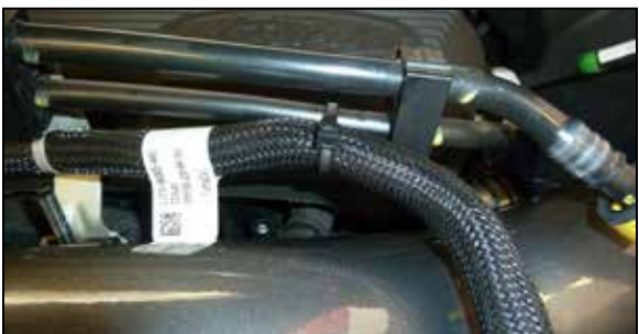
16. Secure the coolant hose using the provided tie wrap.