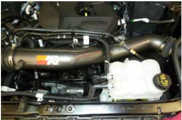
15. Install the intake tube into the factory turbo inlet and then into the hump coupler, align for best fit and then secure with the provided hardware.