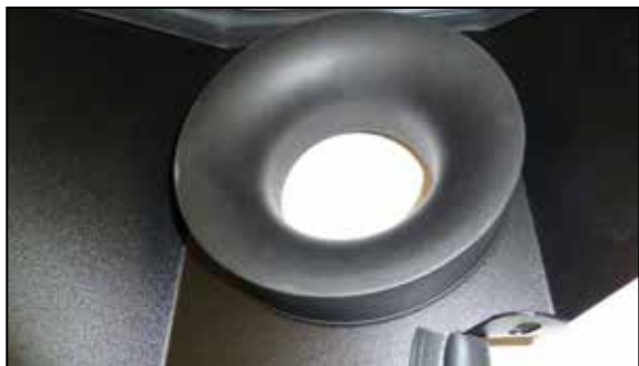
7. Install the filter adapter into the heat shield and secure with the provided hardware.