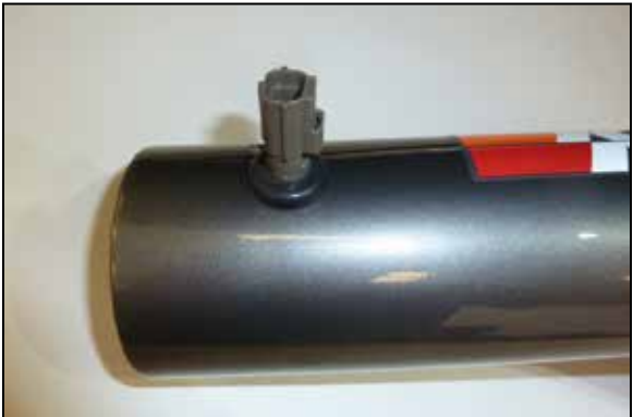
14. Remove the inlet air temperature sensor from the factory air filter housing, remove the O-ring and then install it into the K&N intake tube using the provided grommet.