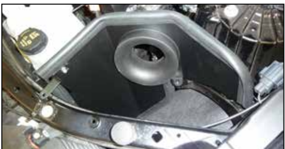
9. Install the heat shield into the vehicle as shown.