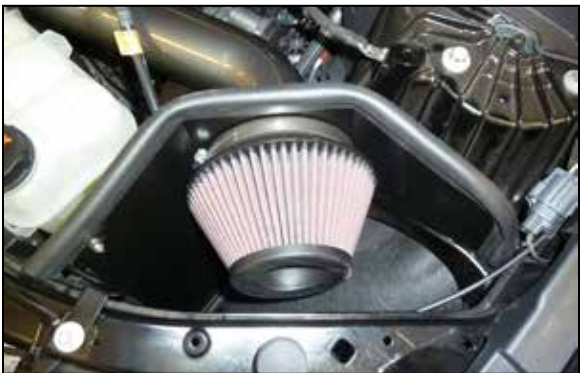
18. Install the K&N air filter and secure with the provided hose clamp.